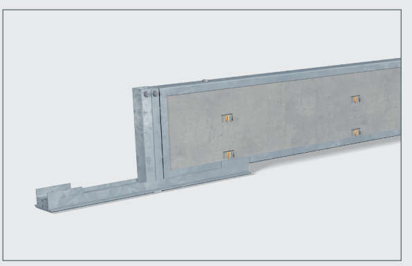
Standard element 10 metres